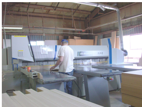
Mille Fab / Cutting Machine