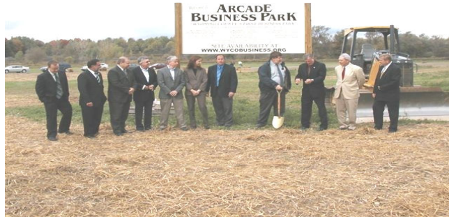
Ground Breaking at the Arcade Business Park